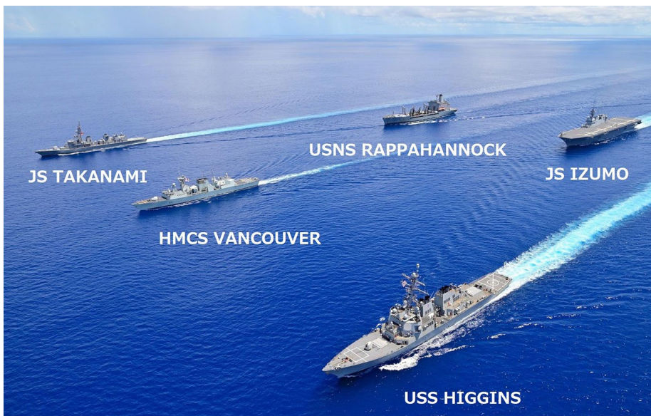
9 September 2022. Guam to South China Sea. Exercise Noble Raven.

For decades, Canada has based its policy of engagement with China on the assumption that, over time, the regime would evolve toward economic liberalism and democracy, which would lead to a greater respect for civil rights. While doing so, the belief was that Canada would benefit from trading with