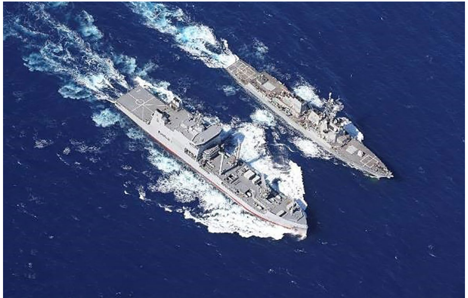
25 January 2022. Pacific Ocean. USS Sampson (DDG 102), right, conducts a replenishment-at-sea with the New Zealand navy oiler HMNZS Aotearoa (A11) as they support disaster relief efforts in Tonga.

Of the two principal challenges identified—strategic competition and climate change—the former is seen as being inextricably linked to the rise of China and the latter’s effects as being felt soonest in the Pacific: New Zealand’s ‘immediate neighbourhood’. The Pacific also featured in an announcement by the Minister of