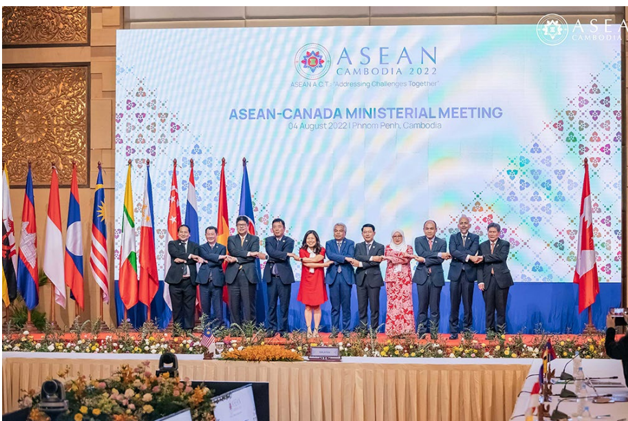
4 August 2022. Phnom Penh, Cambodia. ASEAN-Canada Ministerial Meeting.

Trade, even with China, will remain an important part of Canada’s strategic considerations in the Indo-Pacific region, and while there is a consensus about Canada’s need to diversify its exports and partnerships in Asia and to move away from “doing more, more, more” with China, Ottawa needs a strategy so it can do so successfully. Especially as Washington’s confrontational posture toward Beijing puts its allies in a difficult position, an Indo-Pacific strategy will clarify its intention to its allies. Many experts have called for Canada to take on an independent foreign policy from the US on Asia and especially China, but with Washington having in recent years taken a harder stance towards China and now even seemingly seeking to contain it, at least on the technology side, this certainly puts US allies in a difficult position. And despite saying otherwise, Washington is now arguably increasingly trying to force its allies to pick a side. How to carry on working with China while strengthening its relations with the US is at the very centre of Canada’s debate about its Indo-Pacific strategy and two broad visions are being pondered on.