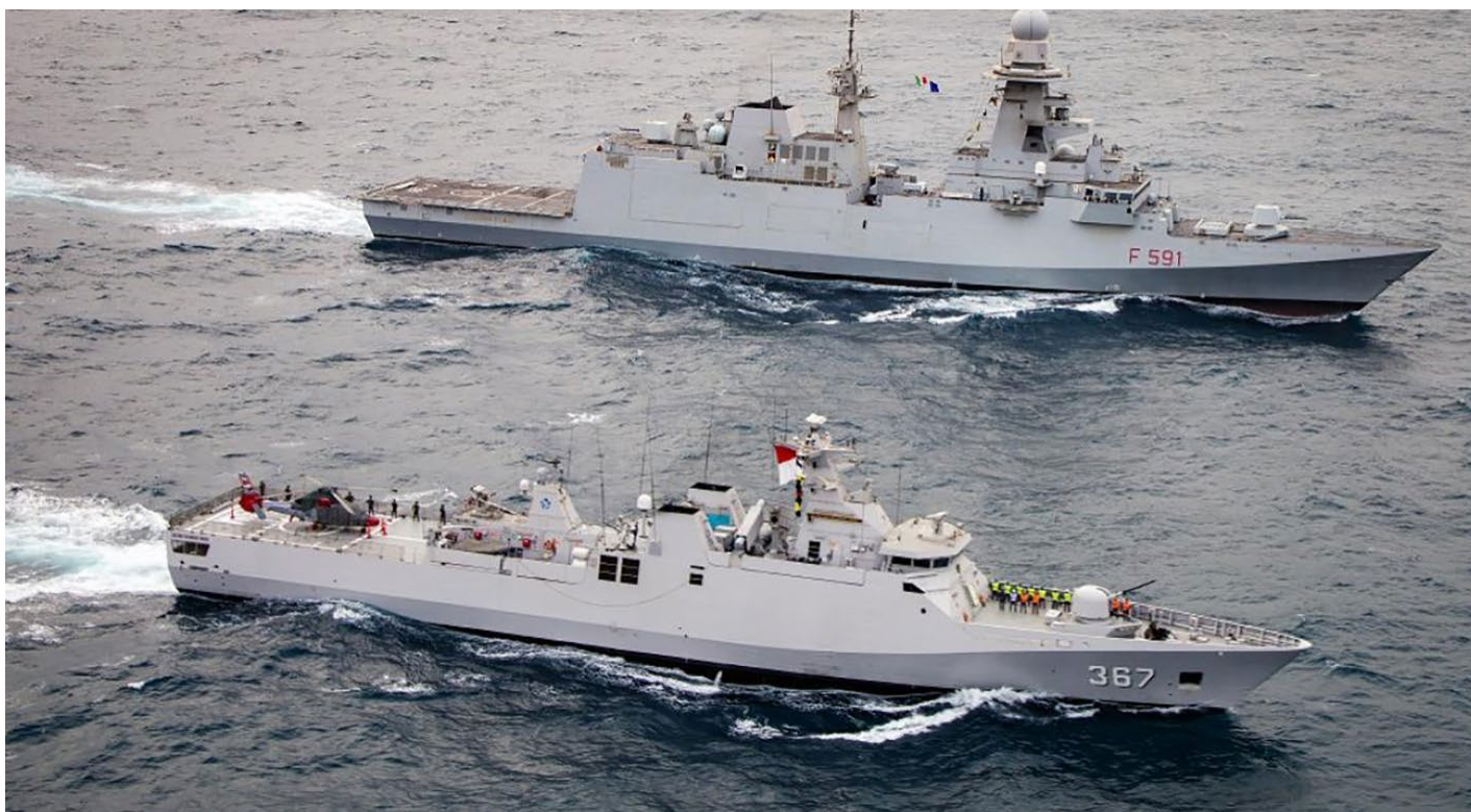
14-15 August 2022. Arabian Sea. Indonesian and EU navies, Operation Atalanta.

global economy in the post-pandemic world. The war in Ukraine has forced the Indonesian government to respond on two fronts in particular. First, to secure the supply of commodities, such as wheat and potassium that are critical to domestic food production given that Ukraine and Russia are major suppliers of these commodities. Second, the continuing tension between Russia and the NATO countries constituted a major challenge to the success of Indonesia's G20 presidency. As G7 countries were determined to express their condemnation of Russia's invasion, including in preparatory meetings for the G20 summit, Indonesia has been challenged to think hard on how to protect the group's main economic agenda from being overwhelmed by the fierce political brawl over the situation in Ukraine.