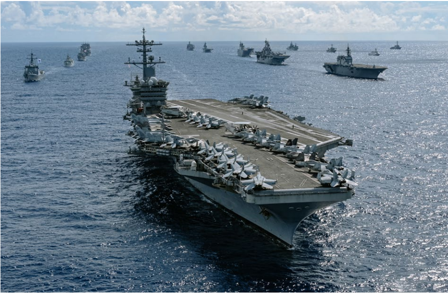
28 July 2022. Pacific Ocean. USS Abraham Lincoln (CVN 72) in formation during RIMPAC 2022.

Approaching China in a more containment-focused manner, rather than continuing to carefully calibrate competition, would likely play well with American voters. Polls show that it has never been more popular to be anti-China in the United States. But what plays well at home would increase the risk of confrontation abroad.