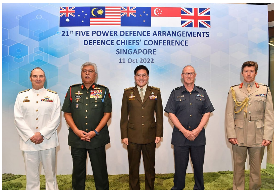
11 October 2022. Singapore. Defence chiefs of the Five Power Defence Arrangements meet at the Defence Chiefs' Conference.

China, for its part, has contributed to rising tensions. Most recently, President Xi Jinping's speech at the 20th Party Congress reiterated the