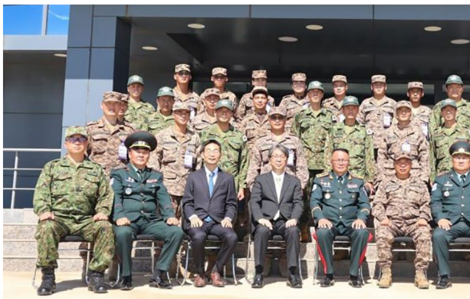
1 August 2022. Ulaanbaatar, Mongolia. A joint military engineering exercise, 'Road-2022', between the Mongolian Armed Forces and the Japan Self-Defense Forces.

Faced with this complicated overarching setting, Mongolia has pursued active multilateral diplomacy while endeavouring to distance itself from the geopolitical competition between the West and its two powerful neighbours. In June 2022, Mongolia organised an international conference on strengthening the role of women peacekeepers under the UN Women, Peace, and Security initiative. The conference was attended by the UN Under-Secretary-General for Peace Operations Jean-Pierre Lacroix and 60 female peacekeepers from 30 countries, including the five permanent members of the