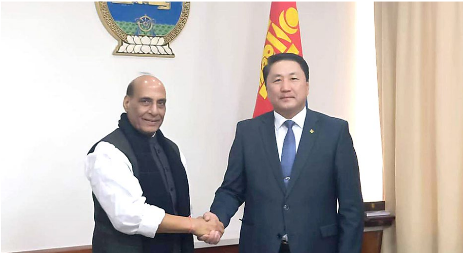
6 September 2022. Ulaanbaatar, Mongolia. India Defence Minister Rajnath Singh and Mongolian counterpart Saikhanbayar Gursed discuss defence cooperation.

over of Crimea, Mongolia has begun to feel pressures from both sides. This choice would be a nightmare for Mongolia since it's too vulnerable to pressure from Russia and too isolated for Western countries to rescue. Although we don't know how the Russia-Ukraine war will unfold in terms of scope, scale, and duration or how the overarching geopolitical contest between Russia and the US (plus partners) might play out, there are two prominent risks for Mongolia. The first risk is that, although Mongolia has long looked to Russia to contain China's power and influence, the Kremlin becomes increasingly attracted to and focused on reviving the Soviet-like sphere of influence, bullying its neighbours, including those in Eurasia and Central Asia as well as Mongolia. This potential risk triggers Mongolian memories of being controlled by the Kremlin and deprived of crafting its own foreign and domestic policy settings. The second risk would be a weak Russia, a Russia absorbed by its own political and socio-economic crises. This also raises concerns in Ulaanbaatar as the country would encounter China's rising power and influence and, in the absence of Russia, more readily slide into China's orbit. Both scenarios help explain the priority Mongolia attaches to its other neighbours and