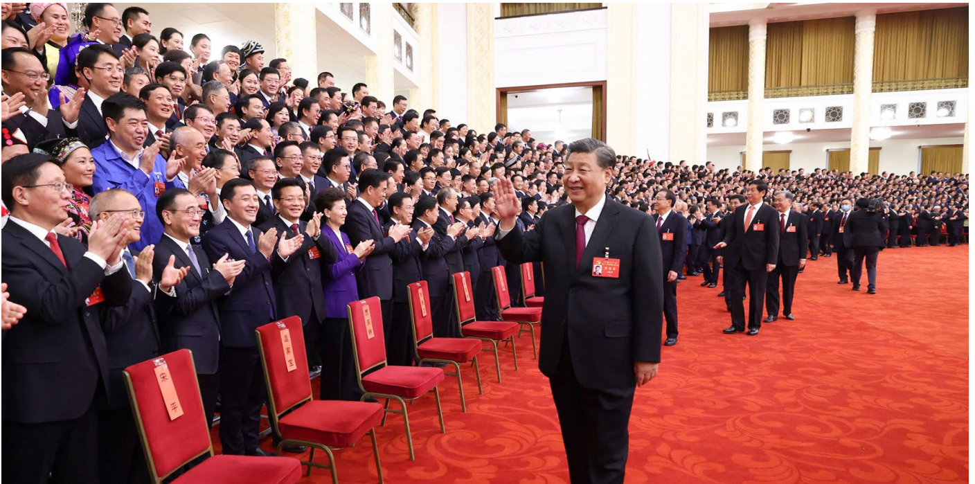
23 October 2022. Great Hall of the People. Xi Jinping and other leaders at the 20th CPC National Congress.

When Russia's President Vladimir Putin launched his 'special military operation' to invade and occupy neighbouring Ukraine on 24 February 2022, the world shuddered. In a painstakingly premeditated manner, Putin stepped over perhaps the most foundational norm of the prevailing international order – the norm prohibiting the use or threat of use of force against the territorial integrity or political independence of any state that had been set out in seminal documents like the UN Charter and the Five Principles of Peaceful Co-existence. For something like two decades, the international community had sensed the gradual but relentless erosion of confidence in the principles, conventions, and processes designed to foster stability and peace. Over this period, the international political