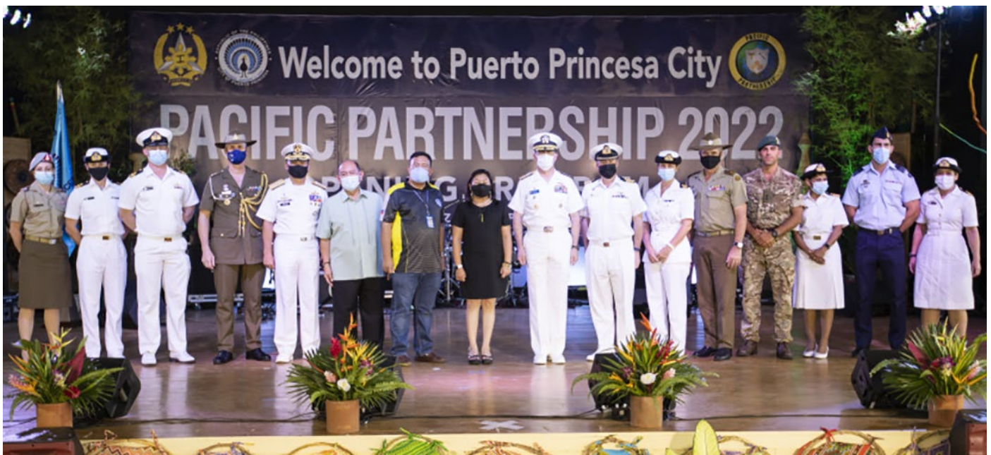
5 August 2022. Puerto Princesa, Philippines. Military officers from Australia, the United States, the United Kingdom and the Philippines at the opening ceremony of Exercise Pacific Partnership.

is the South China Sea issue. Instead of leveraging the 2016 arbitration award in favour of the Philippines, former President Rodrigo Duterte’s “independent foreign policy” entailed a pivot towards China and away from the US. Closer ties to China meant lowering the tensions in the South China Sea, gaining support for the war on drugs, and receiving investment pledges that fuelled the administration’s flagship Build, Build, Build program. The costs of this foreign policy, however, were too great. For one, investment pledges did not translate to infrastructure projects. Further collateral damage involved the alliance with the US when Duterte initiated the abrogation of the Visiting Forces Agreement. The VFA—and the alliance—has since been restored but downplaying the arbitration award also meant that discussions on the South China Sea were marginalised during the Philippines’ ASEAN chairmanship in 2017, maritime incidents involving Chinese militia and Filipino fishermen were understated, and the patrols and presence of the Armed Forces of the Philippines and