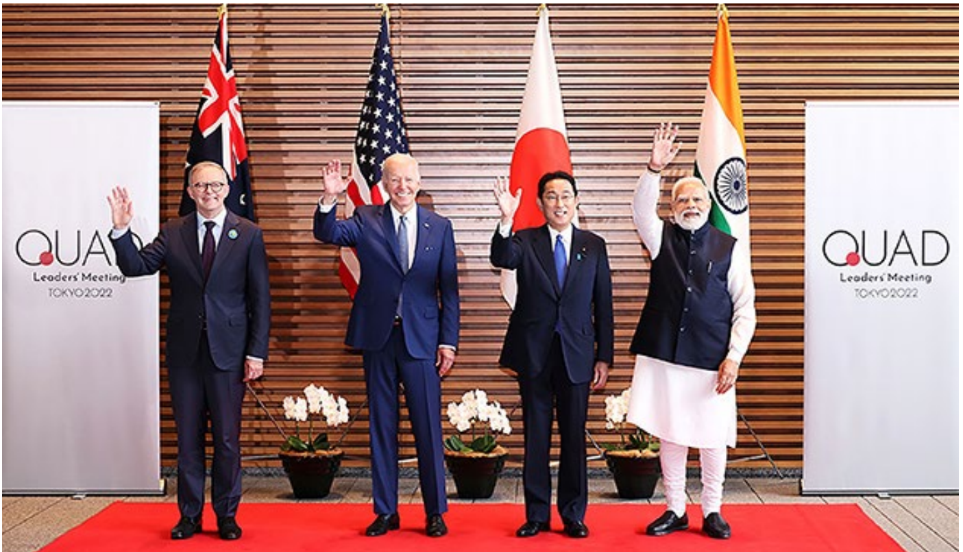
24 May 2022. Tokyo, Japan. The Quad Leaders' Meeting.

of keeping its distance from this competition, and has in fact, become increasingly involved as an important player. Japan's unconditional support to Ukraine, as well as its active diplomacy in the G7 and NATO, has clearly demonstrated its determination to support the Western community. So long as the existing order continues to be challenged by revisionist powers, Japan is likely to sustain this posture.