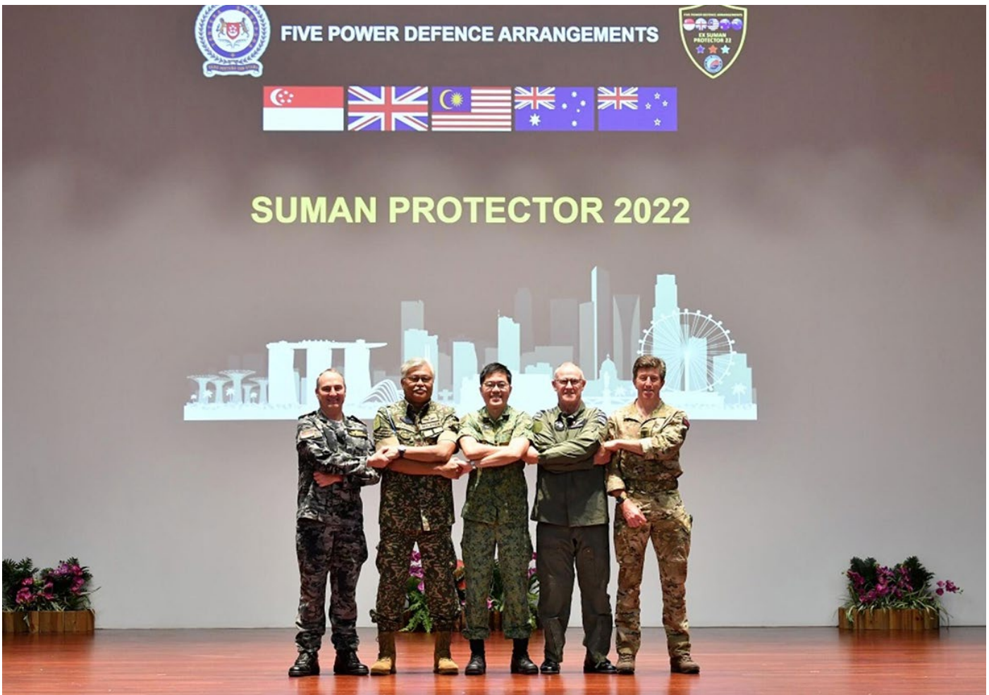
28 October 2022. Singapore. Exercise SUMAN Protector, a Five Power Defence Arrangements (FPDA) command post exercise at the Changi Command and Control Centre.

“While China and the US pay lip-service to the notion of ASEAN Centrality, both superpowers have taken the approach of trying to pull individual countries into their respective spheres...”