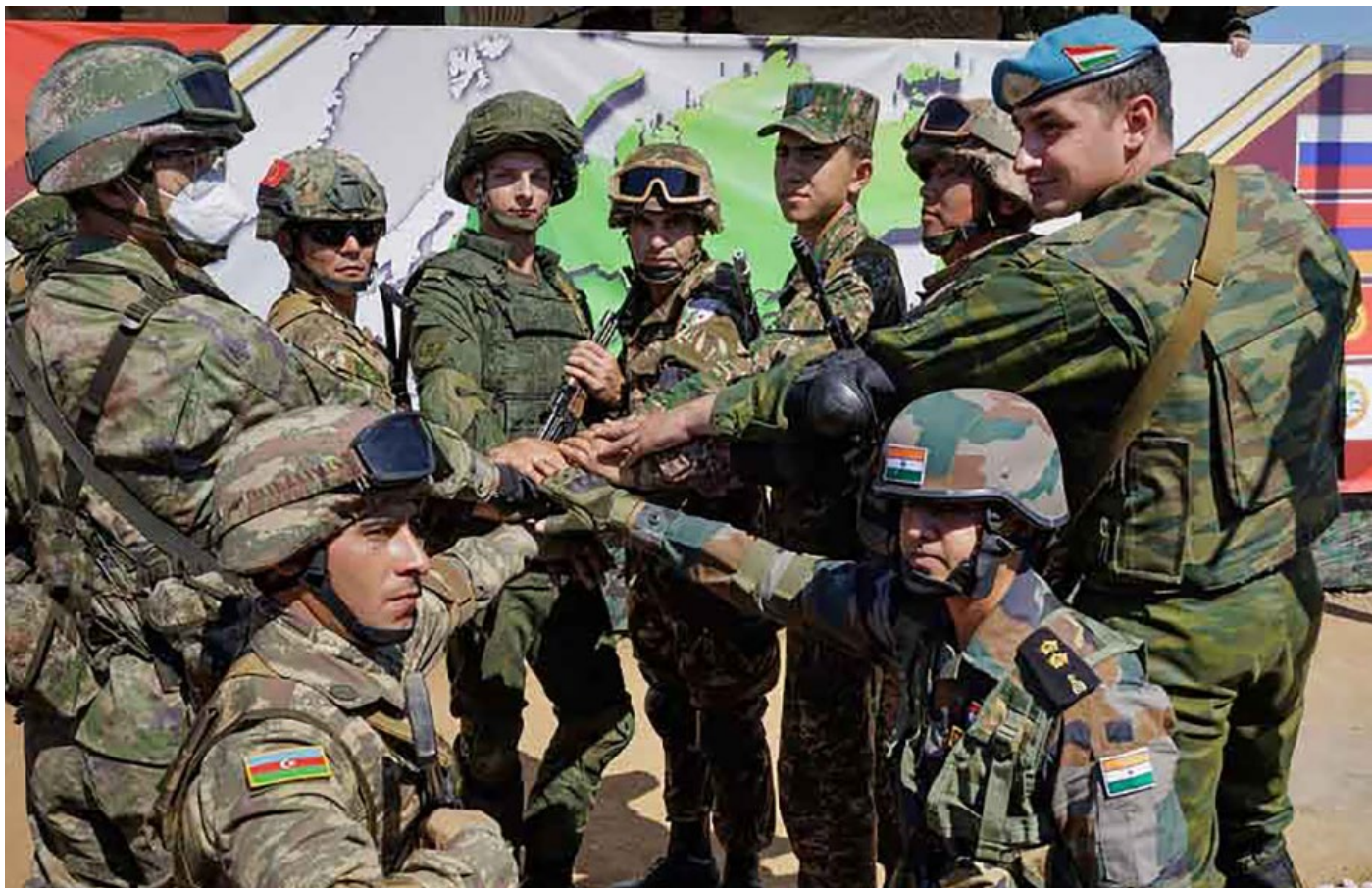
1 September 2022. Sea of Japan. Opening ceremony of Vostok 2022.

Today’s turbulence poses a similar test to India’s ambition to remain a self-reliant, independent pole in the changing world order. Yet while other countries may see the changing regional context as a challenge, New Delhi’s decision makers tend to perceive the rapidly evolving environment more optimistically, as an opportunity. This overall positive outlook is premised on the understanding that in times of global volatility, India’s bridging power assumes indispensable utility.