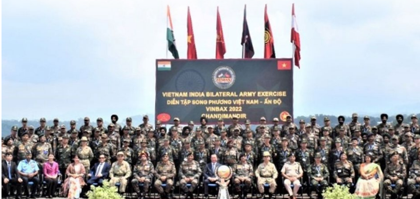
19 August 2022. Chandimandir, India. Vietnam-India Bilateral Army Exercise.

As great power tensions build up and the pressure to take sides increases, small and middle powers have increasingly invoked “strategic autonomy” as both a principle and an objective. Strategic autonomy reflects a country’s freedom to choose partners and cooperation mechanisms—that may include competing initiatives led by different rival powers. It also represents a country’s ability to make its own decision and present forthright opinions on regional and international issues in accordance with its national interests. India, Indonesia, and Singapore are often cited as notably successful examples in consistently exercising strategic