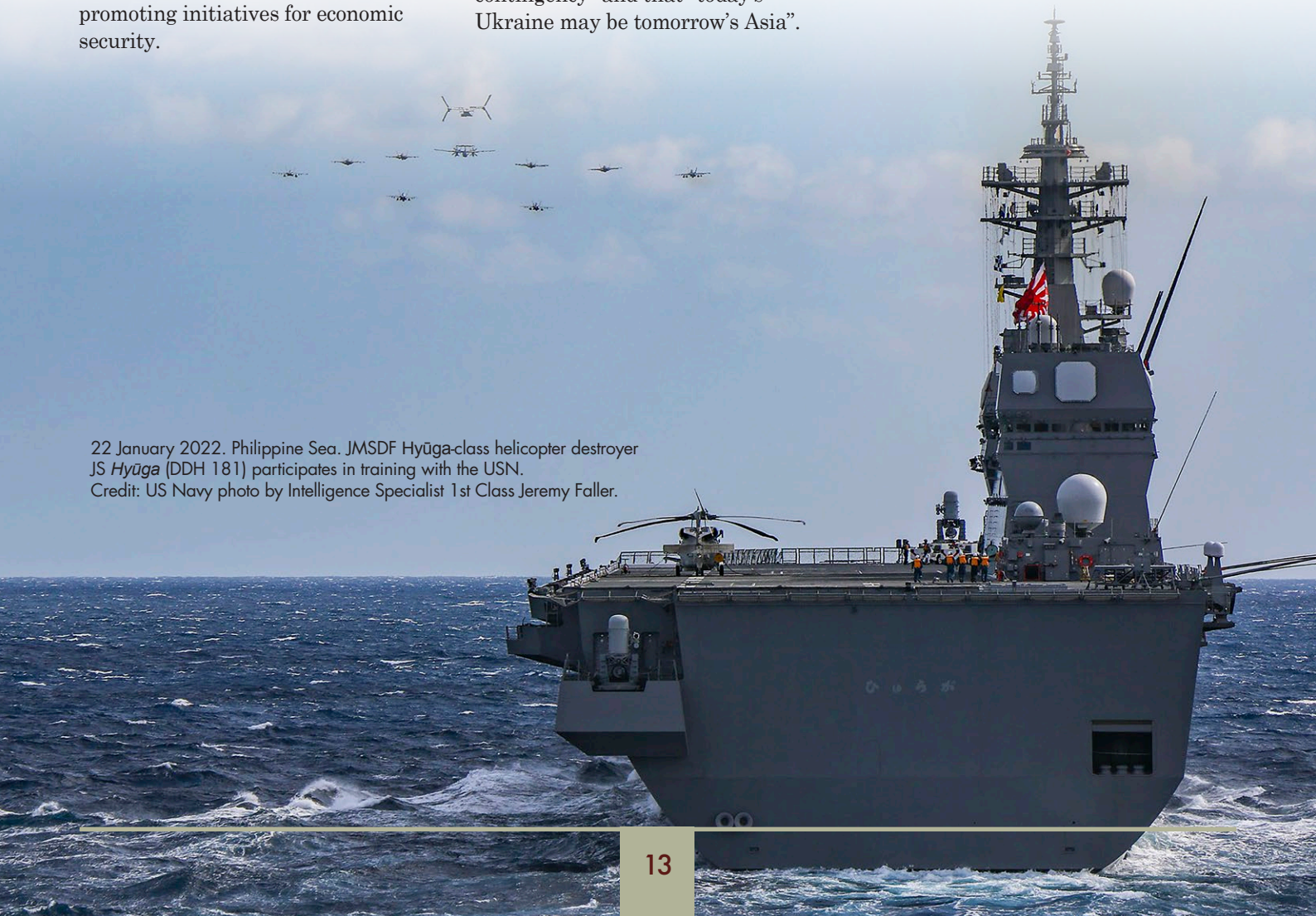
22 January 2022. Philippine Sea. JMSDF Hyūga-class helicopter destroyer JS Hyūga (DDH 181) participates in training with the USN.

This explains why Japan has actively supported Ukraine's resistance to Russia's invasion in line with other European partners. Japan's support to Ukraine includes the provision of non-lethal defence equipment, emergency humanitarian and financial assistance, and the acceptance of evacuees. Japan also joined international sanctions through several financial measures such as the restriction of transactions with Russia's central bank and the exclusion of selected Russian banks from SWIFT. Japan has also phased out Russian oil and coal imports.