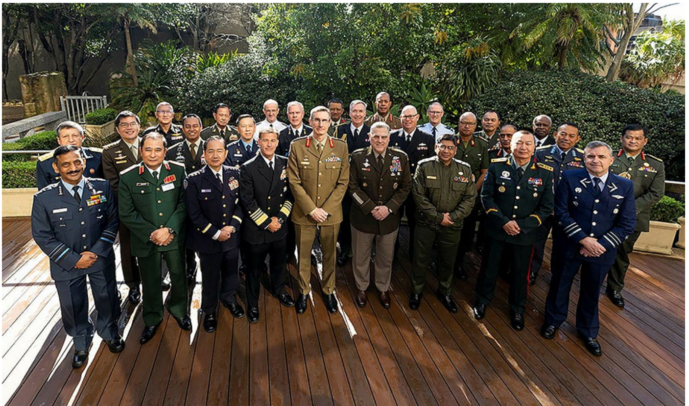
26 July 2022. Australia. 24th annual Indo-Pacific Chiefs of Defence Conference.

The war in Ukraine has not led to the suspension of the EU’s policy to diversify its ties in Asia, from Southeast Asia to Central Asia—in part through the development of transport, digital and energy connectivity projects under the “Global Gateway”—the EU plan launched in 2021 aims to mobilise up to €300 billion in investments by 2027. On the contrary, and independently of the ongoing