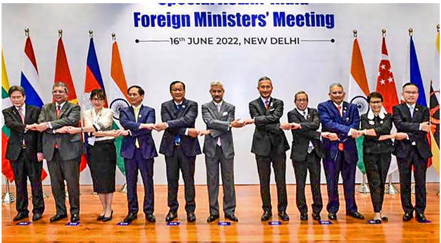
16 June 2022. New Delhi, India. External Affairs Minister S Jaishankar at the Special ASEAN-India Foreign Ministers meeting.

For India all these challenges and risks are real, but the current fog of systemic uncertainty is neither new nor necessarily a source of strategic anxiety. History shows how India's policy of non-alignment has often been a useful navigational device to adapt to change, craft a new balance, and preserve the country's cherished strategic autonomy. For example, after the 1960s, India gravitated to the Soviet Union in response to the United States' growing alignment with China and Pakistan. And after 1991, with the demise of the Soviet Union and a severe balance of payment crisis, the same proudly non-aligned and socialist India once again adapted to the new world order by reforming its economy, deepening engagement with the United States, and pursuing rapprochement with China.