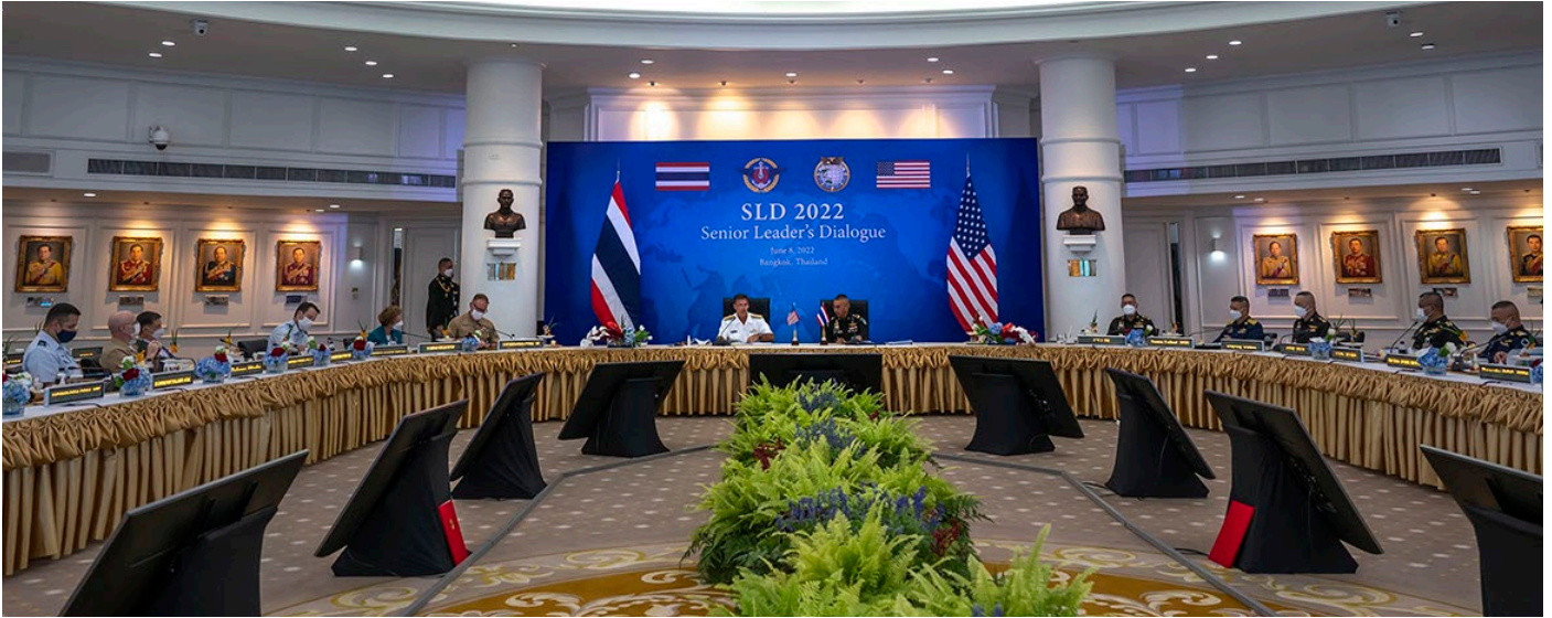
8 June 2022. Bangkok, Thailand. Senior Leader’s Dialogue at the Thailand Ministry of Defence Headquarters.

Metaphorically, Thailand’s security and foreign policy is commonly characterised as “bamboo”, bending with the changing wind. This flexible and pragmatic diplomacy, so the story goes, has helped the country survive and progress throughout its history.