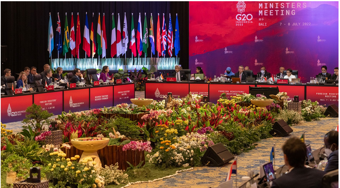
8 July 2022. Bali, Indonesia. Secretary of State Antony J. Blinken attends the G20 Foreign Ministers' Meeting.

the AHA Centre and for the ASEAN Chair's Special Envoy to promote dialogue among the stakeholders, no significant implementation can be seen thus far. The recent ASEAN Emergency Ministers' Meeting on Myanmar held on 27 October 2022 in Jakarta still displayed ASEAN's indecisiveness on what the organisation should do after being frustrated by the junta's violent acts and simply pushed any final decision into the future.