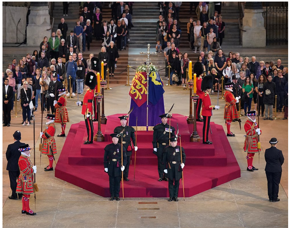
15 September 2022. Members of the Royal Company of Archers guard the coffin of Queen Elizabeth II, as members of the public pass the coffin inside Westminster Hall.

The recent multilateral gatherings – the Shanghai Cooperation Organisation Summit in September 2022 in Uzbekistan, and the G20 and APEC Summits in Indonesia and Thailand respectively in November 2022 – have not only underlined diverging views on the war in Ukraine, but also diverging hierarchies of priorities for the other prominent issues on the international agenda. Some countries, including all EU member states, consider that war in Ukraine should be and remain at the top of the bilateral and multilateral agendas, whereas others, including China and several Southeast Asian countries, consider that it should not monopolise regional and international discussions. This generates a new form of multilateral cacophony leading to tensions from the very early stage of preparations for summits and other major