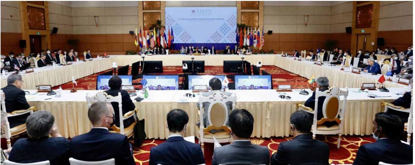
5 August 2022. Phnom Penh, Cambodia. 12th East Asia Summit (EAS) Foreign Ministers' Meeting.

Southeast Asian region and force the countries in the region to take sides. If this were to happen, Cambodia could well be surrounded by US allies particularly Thailand and Vietnam. While Thailand has been quiet on Cambodia's close relations with China, Vietnam has appeared to be more concerned. Vietnam perceives China's engagement with Cambodia as a potentially threatening strategic move to encircle Vietnam. Previously, Vietnam signalled its concerns and sought assurances from Cambodia that Cambodia would never allow its territory to be used against Vietnam. In 2019, Vietnam released its Defence Paper warning of "interference" and "division" of its bilateral relations with Cambodia. In that same year, Cambodia and Vietnam signed an agreement to establish the basic principle for their bilateral relations that "the two sides agreed to strengthen cooperation in defence and security based on the principle of not allowing any hostile forces to use their respective territories to harm the other's security."