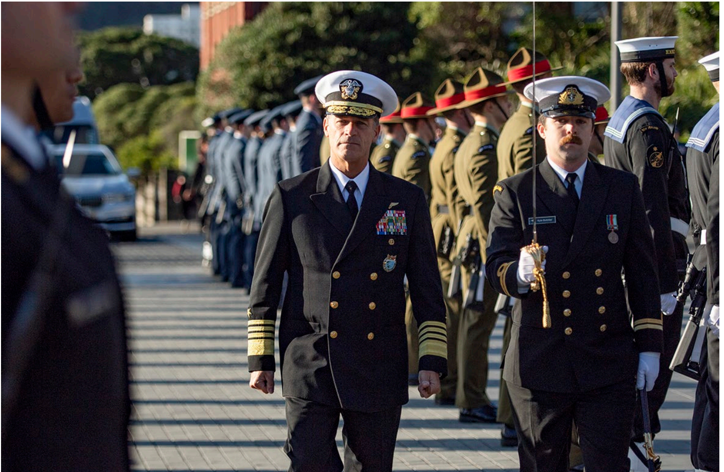
31 July 2022. The Chief of the New Zealand Defence Force Air Marshal Kevin Short welcomes Admiral John C. Aquilino Commander US Indo-Pacific Command.

In February, New Zealand reacted quickly to Russia's invasion of Ukraine. Ardern and Mahuta condemned it and called on Russia to cease its military operations and withdraw immediately. New Zealand joined in sanctioning a significant number of key individuals and entities in the Russian government and, while NZDF personnel could not enter Ukraine, it allowed its direct support to trend upward from assistance with intelligence and air transport to the provision of funding for lethal equipment and training in its use.