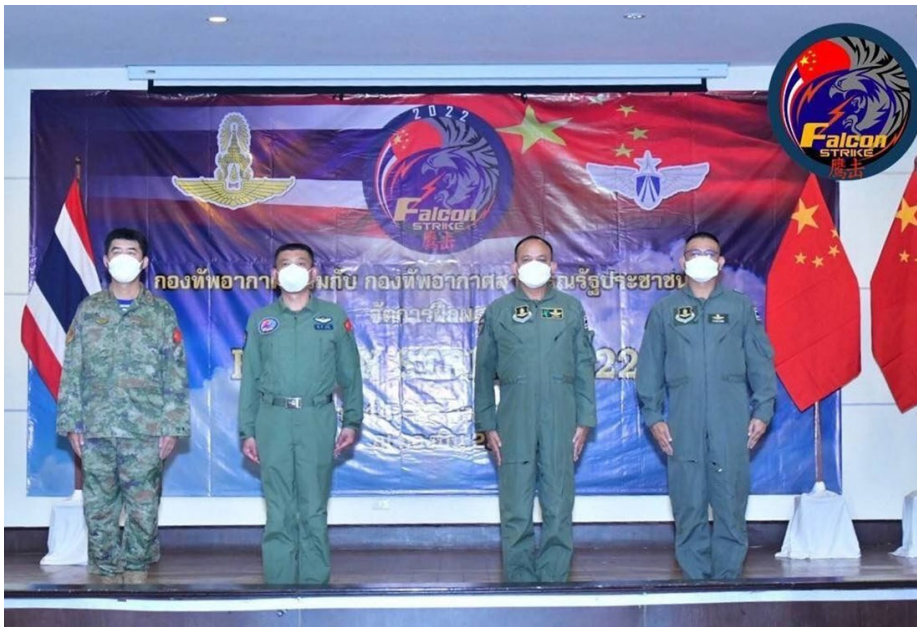
14 August 2022. Udon Thani Province, Thailand. Falcon Strike between the Thai-Chinese Air Force.

the war in Ukraine contest the effectiveness of Thai foreign policy.