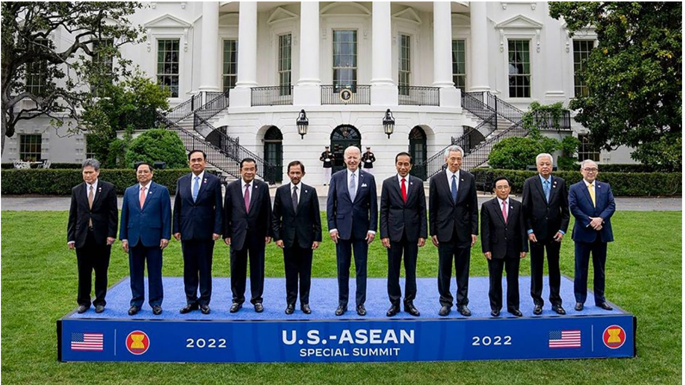
12-13 May 2022. Washington, D.C. ASEAN and the US gather for the Special Summit.