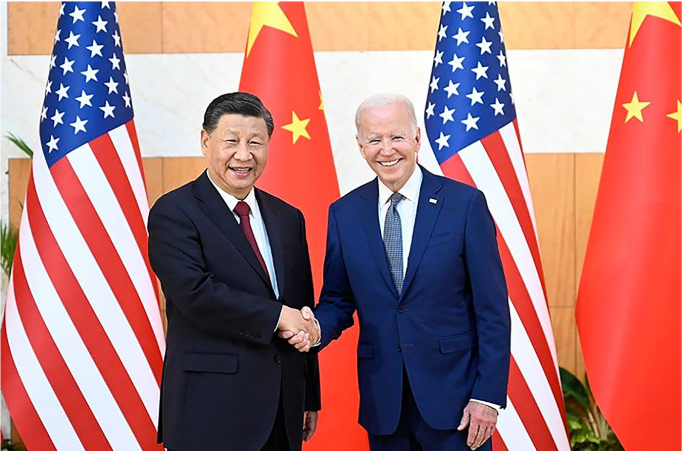
14 November 2022. Bali, Indonesia. Xi Jinping and Joe Biden meet ahead of the 2022 G20 summit.

to seek a more reliable balance in additional and/or stronger external countervailing arrangements. This is regrettable because such external checks and balances are inescapably more blunt and assertive than internal ones. The revival of the Quad process in the Indo-Pacific, the trilateral AUKUS arrangement to deliver—amongst other things—nuclear-powered submarines to Australia and the urgent interest the Ukraine conflict generated in Sweden and Finland to secure NATO membership could be seen in this light. The shock of Russia’s weakly rationalised but painstakingly premeditated invasion of Ukraine in 2022 was exacerbated because it encountered already weakened international confidence in the conventions and processes designed to ensure stability and peace. China’s