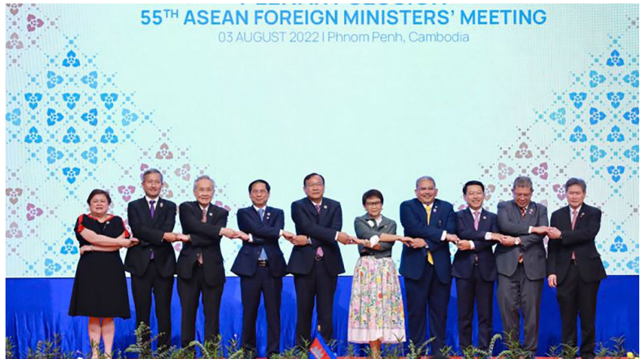
3 August 2022. Phnom Penh, Cambodia. 55th ASEAN Foreign Ministers’ Meeting.

In contrast to Duterte, Marcos seems more inclined to put the South China Sea front and centre. In his first State of the Nation Address in June 2022, he put his foot down about “not giving up an inch” of Philippine territory to any foreign power. The strong stance stood out in a positive way. At the same time, however, it obscured the concrete steps that are necessary to achieve that objective. He made no mention of the 2016 arbitration award, and neither did he indicate the platforms that the Philippines could use to leverage the award. The devil is in the details, and the lack thereof stand out in Marcos’ foreign policy. This notwithstanding, Marcos reiterated maritime security in the ASEAN Summits and related meetings in Cambodia in November 2022. The frame he used at the ASEAN-US Summit was transnational crime and the need to enhance maritime cooperation to combat illegal, unregulated and unreported fishing, marine plastic debris, and marine pollution. At the ASEAN Plus Three Summit, meanwhile, he emphasised safety and freedom of navigation in accordance with international regimes like UNCLOS. In the days following the meetings in Phnom Penh, both China and the Philippines agreed to back the early conclusion of the Code of Conduct. The optics are