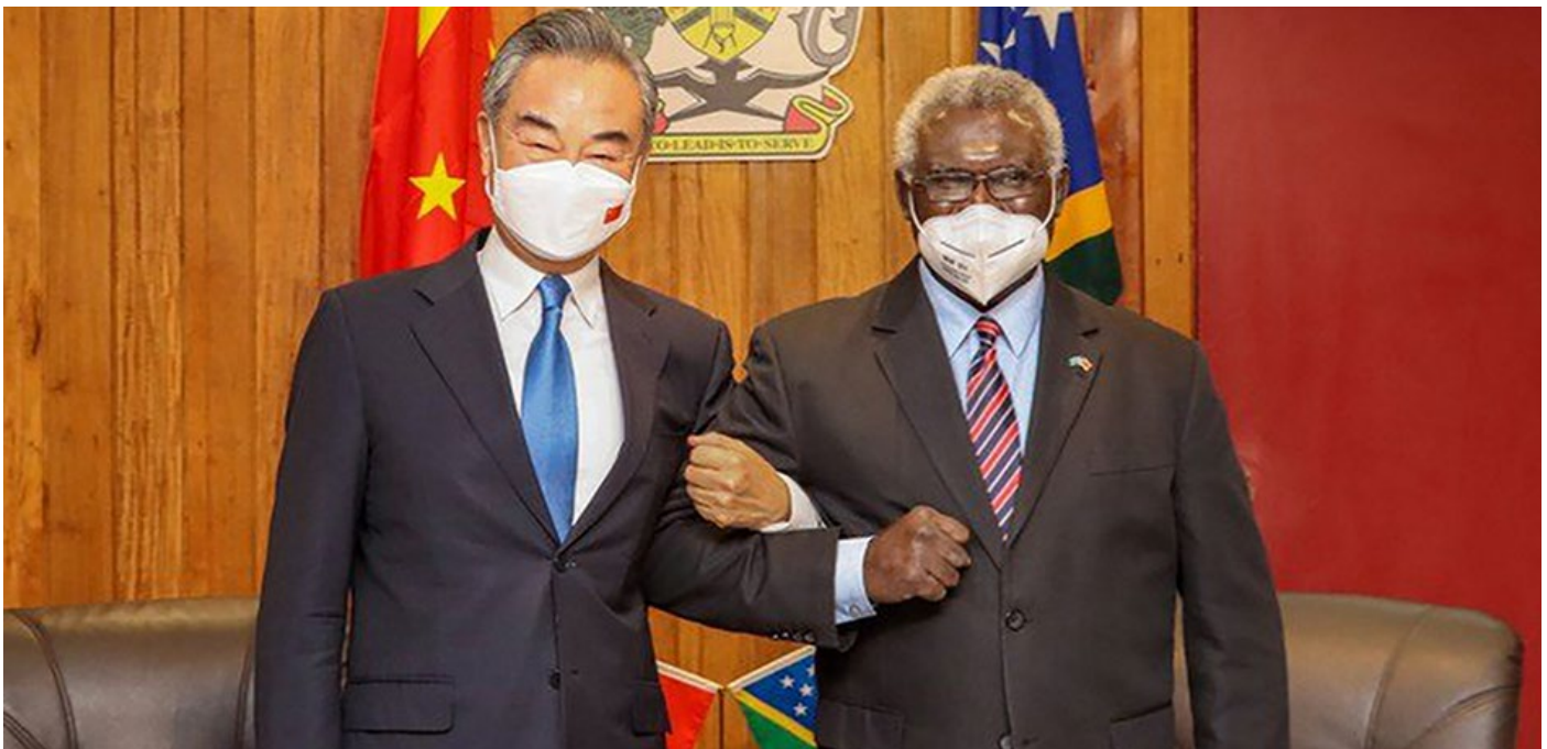
26 May 2022. Solomon Islands. Chinese State Councilor and Foreign Minister Wang Yi holds arms with Solomon Islands Prime Minister Manasseh Sogavare.

Editor and Adjunct Associate Professor, Strategic and Defence Studies Centre, Australian National University.