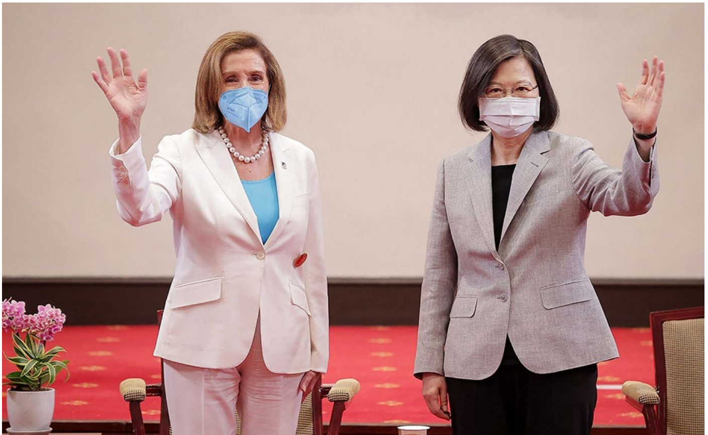
3 August 2022. Taipei, Taiwan. US House Speaker Nancy Pelosi visits Taiwan President Tsai Ing-wen at the Presidential Office.

Stemming from that consensus is a clear security concern: that China will foment conflict by doing something so rash, likely over Taiwan, that the United States has no choice but to respond, or, with communication channels shuttered, that some kind of military error leads to an inevitable ramping up of conflict between the two. For Americans, the greatest concern is not that the United States will start a war but that China takes such egregious action that Washington must respond.