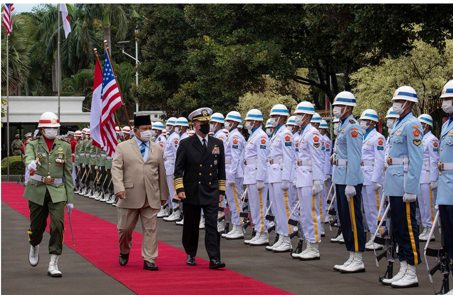
21 March 2022. Jakarta, Indonesia. Welcoming ceremony prior to official US-Indonesian regional security talks.

“As the largest country in Southeast Asia, and particularly since its success as G20 Chair in 2022 as well as assuming the ASEAN Chair in 2023, Indonesia will be expected and pressured to play a significant role...”