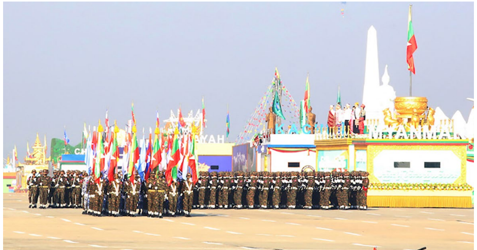
12 February 2022. Naypyidaw, Myanmar. 75th anniversary of Union Day.

At the start, peaceful protests of Myanmar people received praise from the international community as they were creative and genuine. Especially, the inventive activist approach of leading generation Z, the young people of Myanmar (from teenage to late twenties), is different from their prior generations—X and Y—who have been taking a firm and rigid approach to resistance familiar since the first coup in 1962. During the first few weeks, Myanmar could catch international attention with innovative and colourful peaceful protests, including marches of couples in their wedding dress, artists in various costumes, dance troops, cartoonists with their protesting cartoon characters' banners, etc. Banging pots and pans at night around 8pm signified the country-wide civil outcry. When the military intensified the oppression against the protestors, people also changed the tactics to counteract it. A lot of young people went to ethnic armed areas