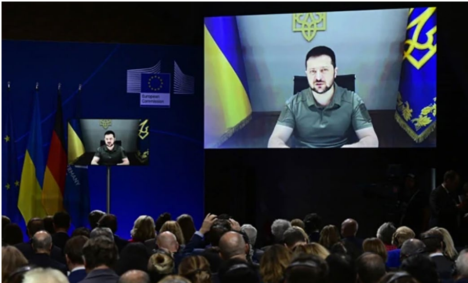
25 October 2022. Berlin. Ukrainian President Volodymyr Zelenskyy addresses a conference on Ukraine reconstruction.

Chechnya and the opposite opinion began to gain strength, the position of the pro-Western faction was still strong.