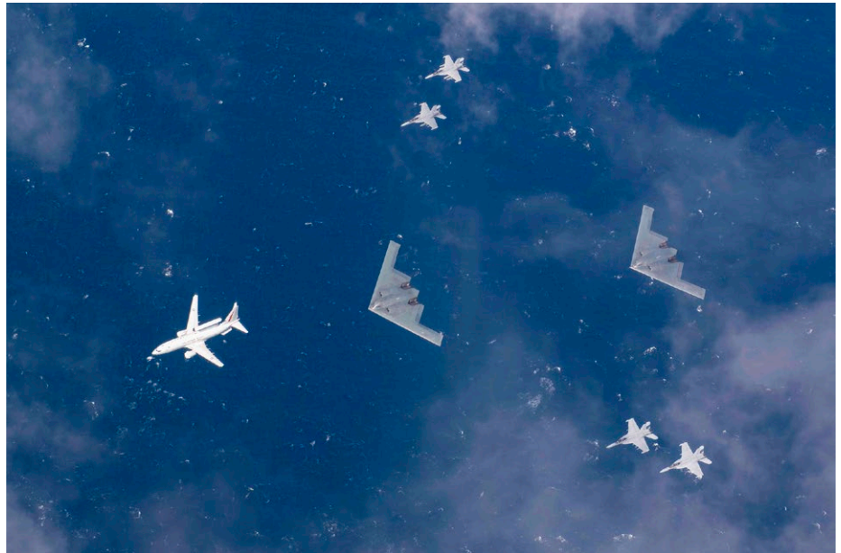
4 August 2022. Australian spy plane leads US B-2 stealth nuke bombers over Pacific.

Expectations were high, then, for the advent of a Labor government which had consistently emphasised out of office that it would prioritise diplomacy in setting the coordinates for Australian foreign and defence policy. And few would dispute the solid start the Prime Minister and senior