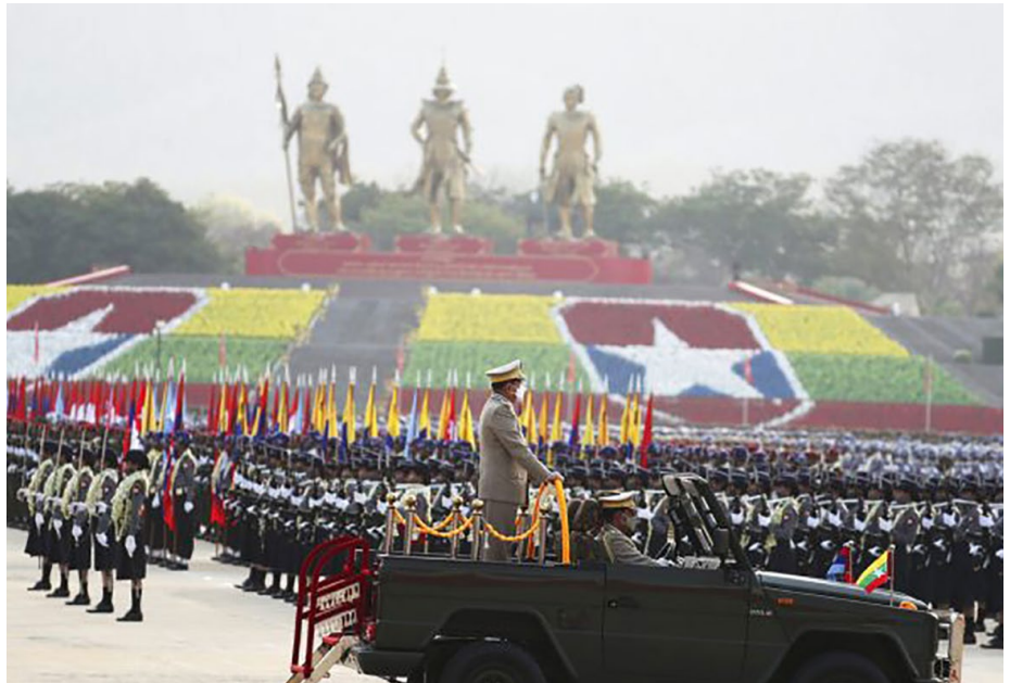
27 March 2022. Naypyitaw, Myanmar. 77th Armed Forces Day.

The growing friendship between Russia, China, and the Myanmar military is a further indication that the divisions in the world