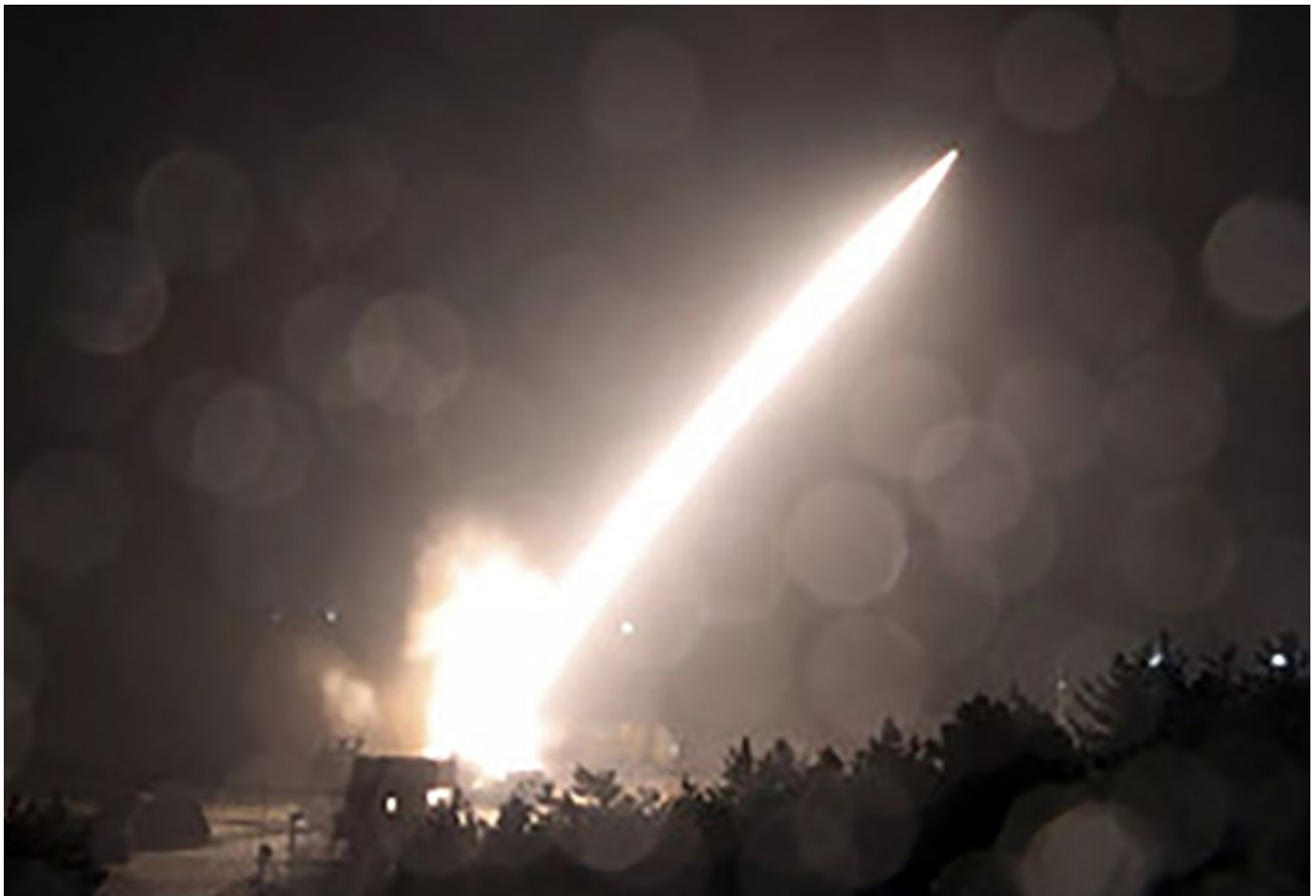
5 October 2022. South Korea. South Korea and the US joint missile firing drills.

and prosperous Indo-Pacific region built on a rules-based order and underlines the importance of core values such as freedom, human rights, and the rule of law. It also condemns unilateral change of the status quo by force. What motivates this strategy is the shift in security landscape where China and Russia are engaging in revisionist actions, the growing importance of economic security, and the demands of next generation Koreans for more active global engagement. However, there are significant constraints that South Korea needs to consider, which differentiates its strategy from that of other like-minded nations. For one, North Korea is the primary existential threat. The Yoon administration proposed the "Audacious Initiative" that calls for