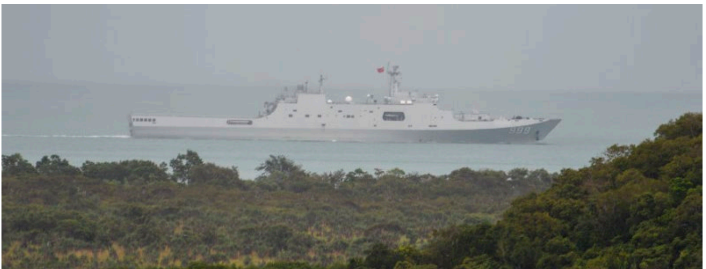
18 February 2022. A PLA Navy vessel transits the Torres Strait.

Defence Minister Marles has been particularly forthright in expressing Labor’s ongoing commitment to the American alliance. “From an Australian point of view” he said in Hawaii following a meeting with his US counterpart Lloyd Austin in October, “our alliance with the United States is completely central to our national security and to our worldview”. During an official visit to Washington in July, Marles gave his personal blessing to the concept that Australian and US military forces would henceforth not only be interoperable but “interchangeable”. Spelling it out, he said the two forces could then “operate seamlessly together, at speed”. Mr Marles has emphasised that the US alliance, far from weakening Australian sovereignty, bolsters it. Indeed, in a major speech towards the end of the year he set out the policy objective: Australia desired to be “the most active participant in the alliance we can be”. This emerged from his